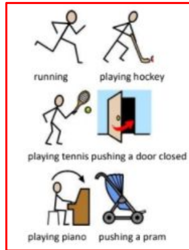
Examples of pushing.