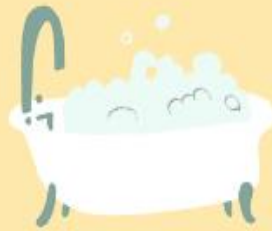
Take a bath