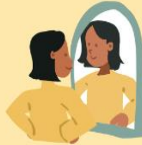
Give yourself a pep talk