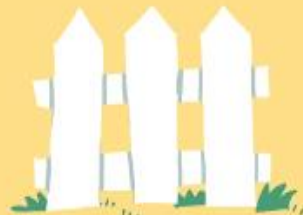
Establish healthy boundaries