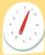
Work on managing time