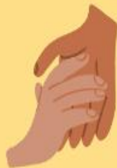
Ask for support