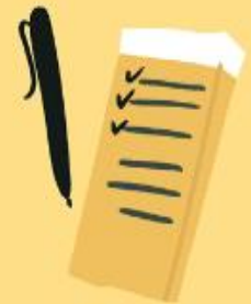
Create a to-do list